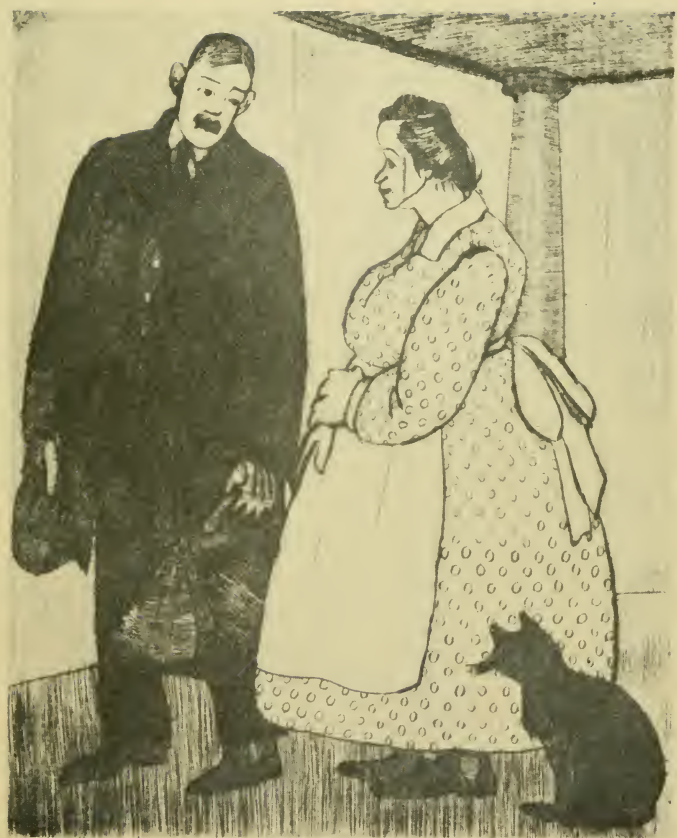
“EARNESTLY EXHORTING THE COOK TO PROTECT ISABELLA”